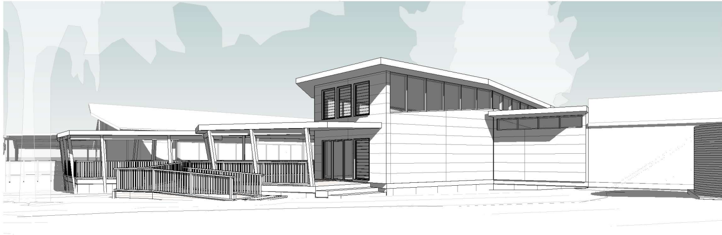
VIEW FROM NORTH EAST