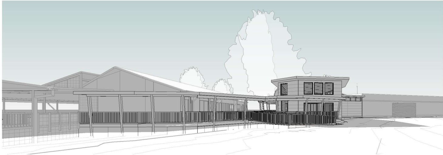
VIEW FROM EAST